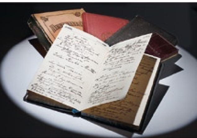
ABOVE A few of Deakin's many diaries Papers of Alfred Deakin, 1804–1973 Manuscripts Collection MS 1540