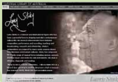
The home page of the Larry Sitsky website, www.nla.gov.au/exhibitions/sitsky