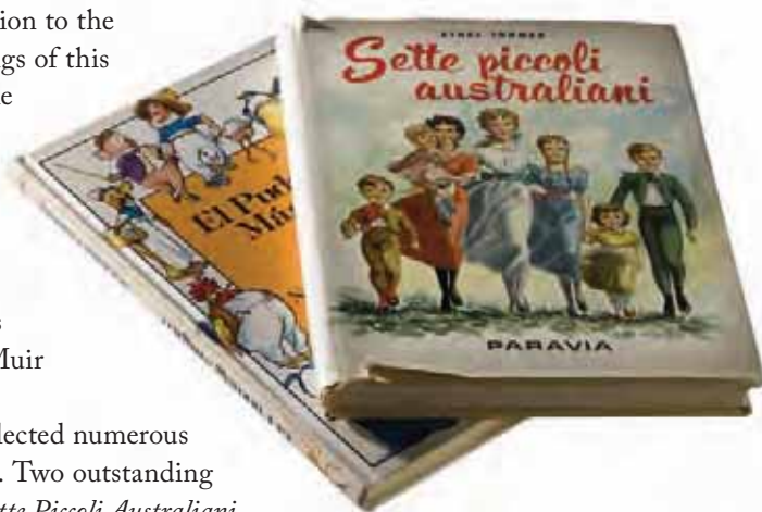
A Spanish edition of Norman Lindsay's The Magic Pudding and an Italian version of Ethel Turner's Seven Little Australians