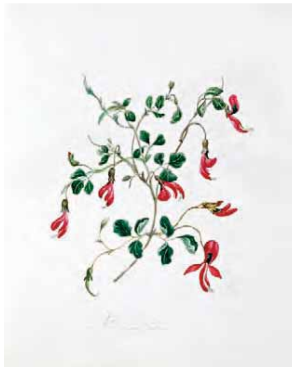
ABOVE Louisa Atkinson (1834–1872) Kennedia sp. between 1855 and 1872 watercolour; 27.7 x 19.2 cm Courtesy Mitchell Library, State Library of New South Wales, PXA 4499, f.7

..... LEONIE NORTON is a botanical artist, tutor and author