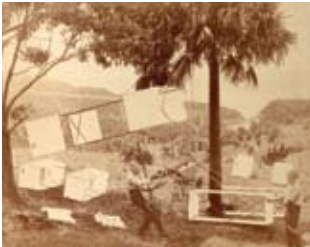
Bayliss, Charles (1850 – 1897)

Died: 14 July 1915, Darlinghurst, New South Wales, of peritonitis