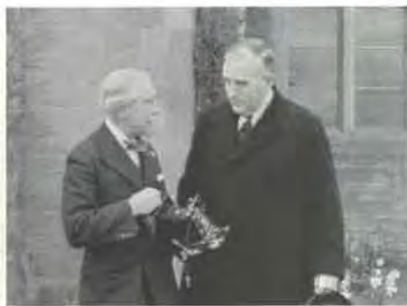
Lord Bledisloe, former Governor-General of New Zealand, with Menzies.