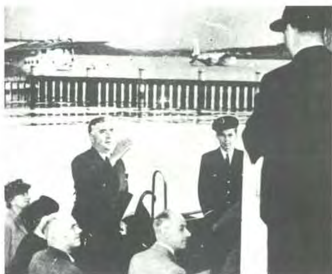
Menzies farewells family and colleagues at Rose Bay, Sydney, before boarding the Qantas Empire Flying Boat Corinna. (Australasian, 26 April 1941)