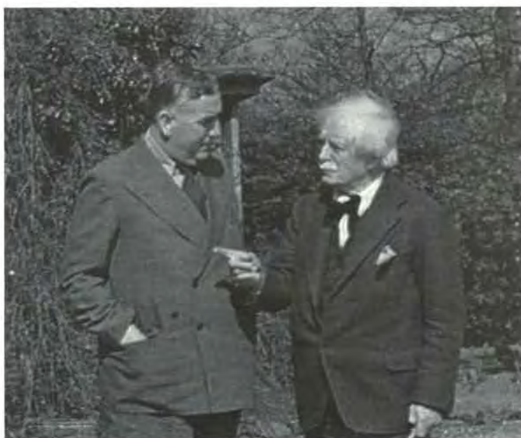
Menzies with Lloyd George.