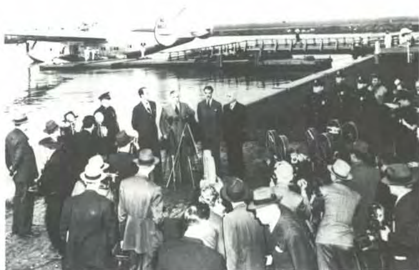
Menzies' Dixie Clipper arrives at La Guardia airport, New York, and he addresses the United States press.