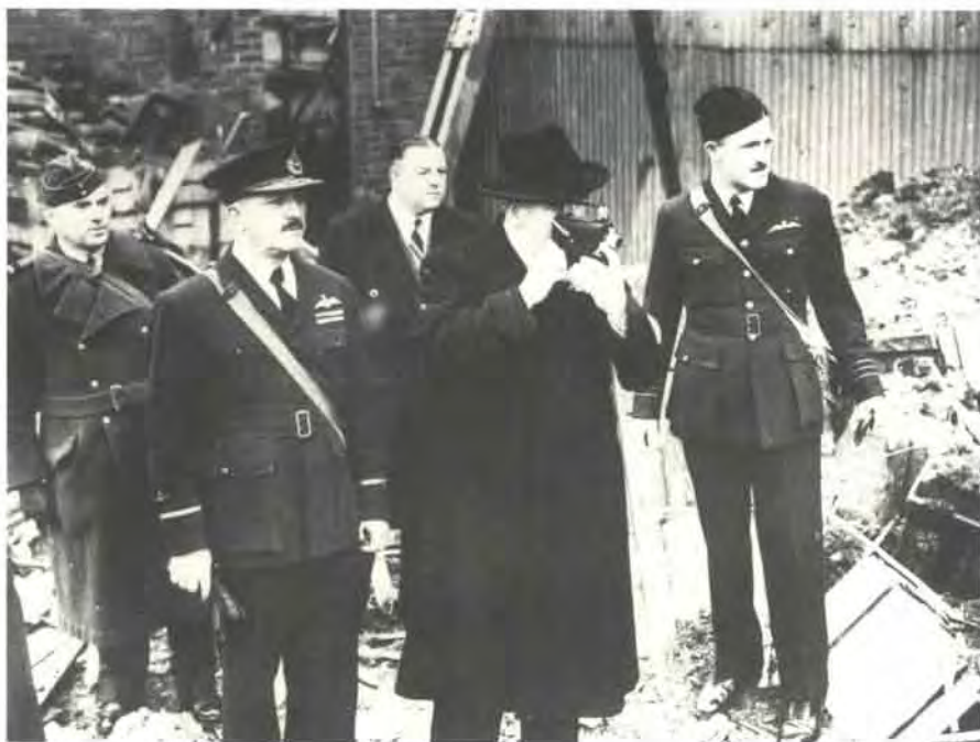
A grim-faced group of Air Force officers waits while Menzies films bomb damage.