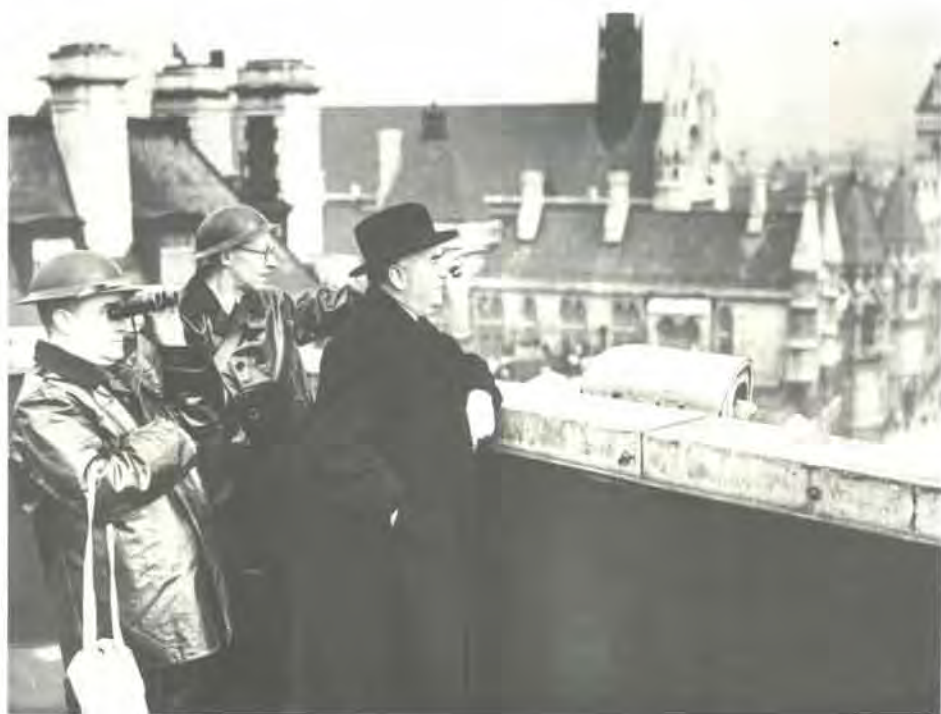
Menzies, accompanied by helmeted air raid wardens, surveys London from the roof of Australia House.