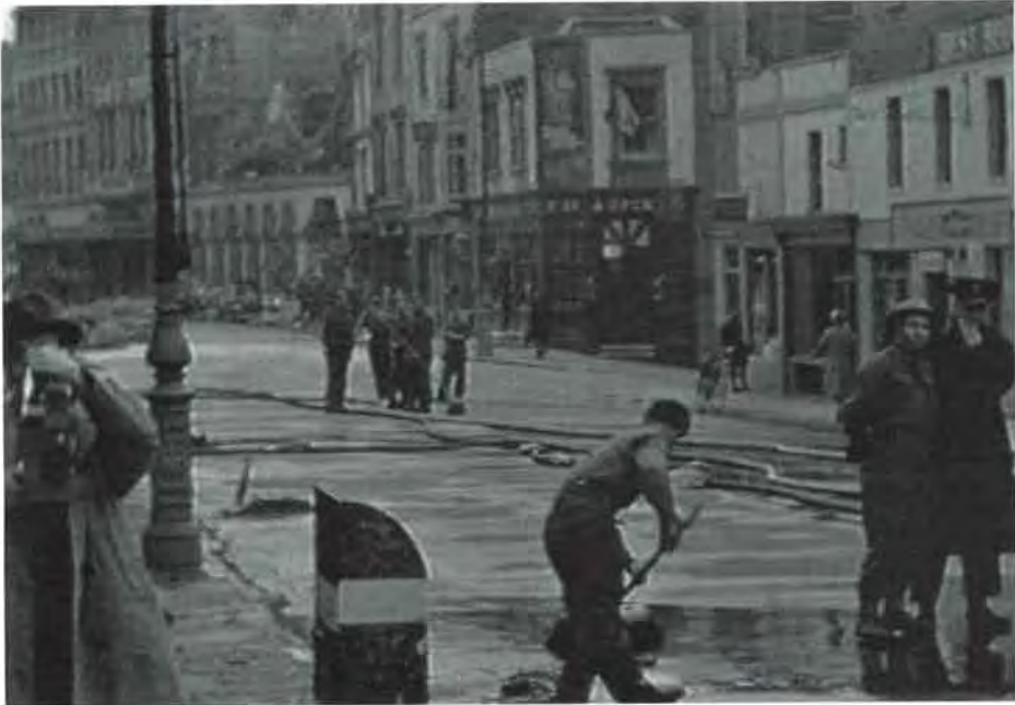
Cleaning up debris after a bombing raid on London.