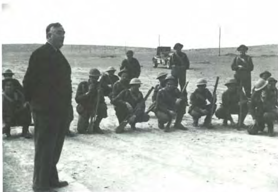
After having the 'sit down and smoke' order given, Menzies addresses members of the 1st Australian Anti-Tank Company in the desert near Tobruk.