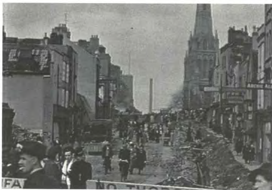
Bomb damage in a Bristol street.