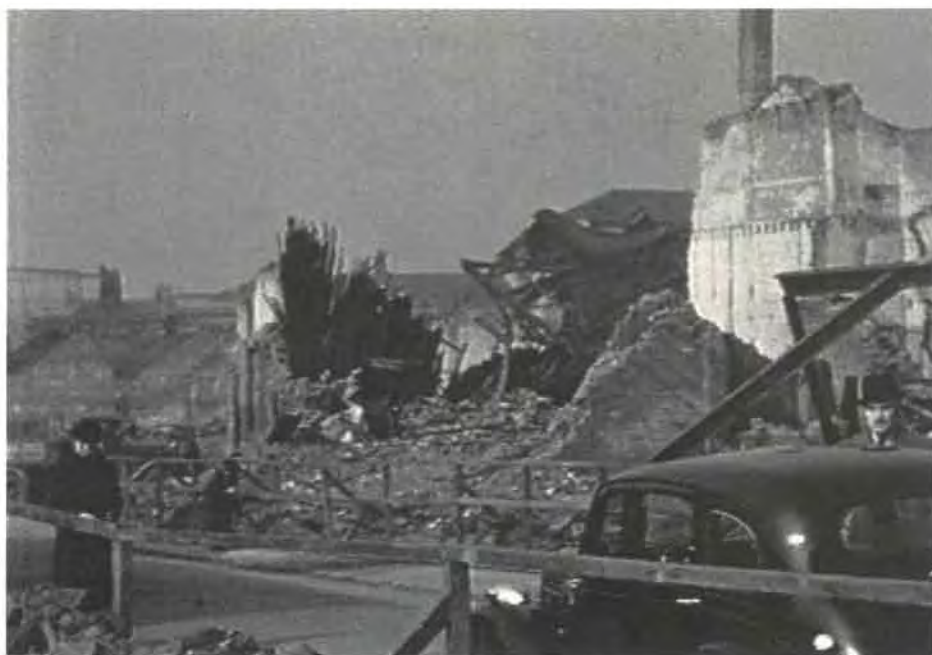
Scene of bombing devastation in Coventry.