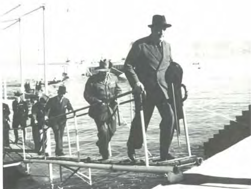
Landing at the Sea of Galilee, Lake Tiberias, in Palestine, Menzies is followed up the gangway by the Commander of the AIF, Lieutenant-General Sir Thomas Blamey, and the British High Commissioner, Sir Harold MacMichael, who received him.