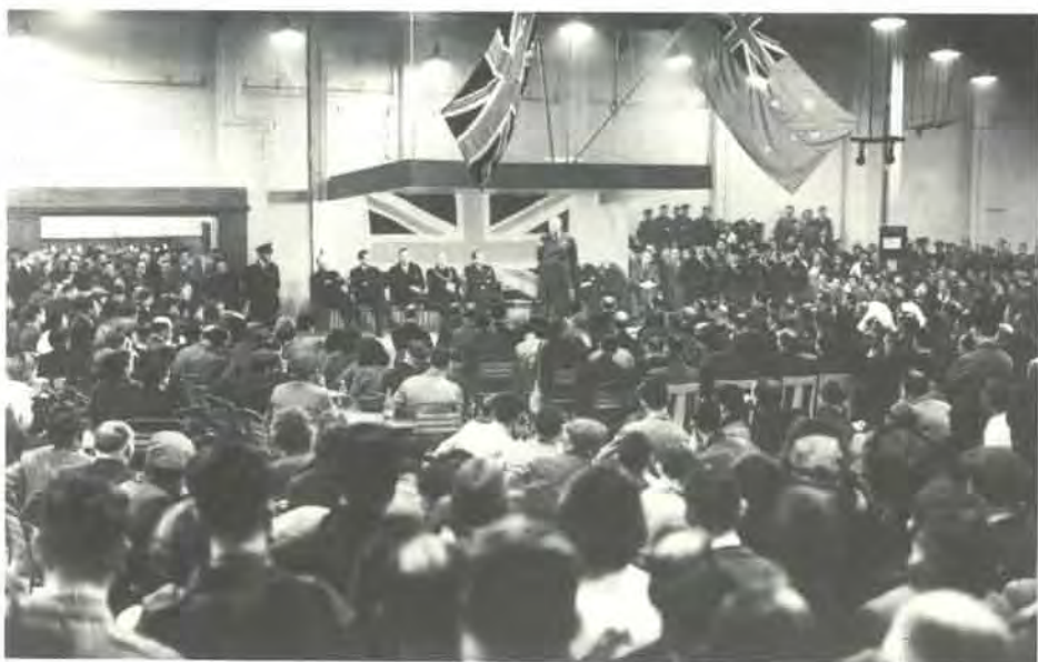
On his visit to Coventry Menzies addresses a large gathering of factory workers in their canteen.