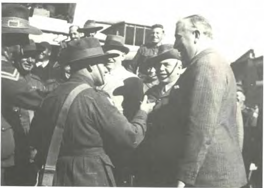
Menzies and Lieutenant-General Blamey exchange pleasantries with a group of Australian soldiers.