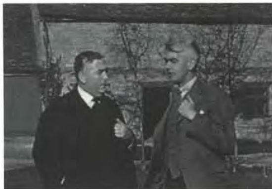
Menzies and W.S. 'Shakes' Morrison, Postmaster-General.