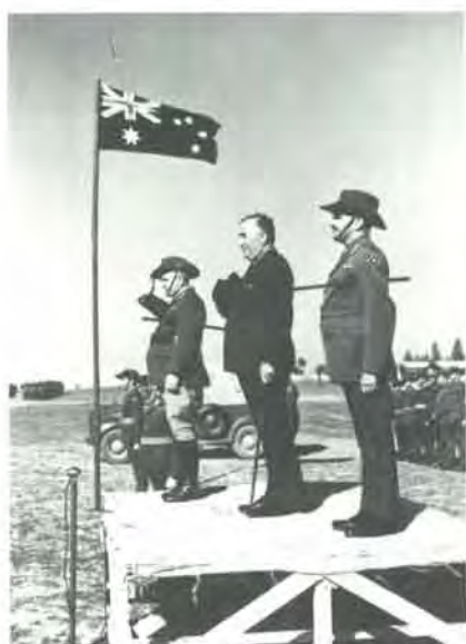
At Julis, Palestine, Menzies stands to attention while Lieutenant-General Blamey takes the salute.