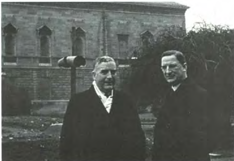
Menzies with the Prime Minister of Eire, Eamon de Valera, in Dublin.