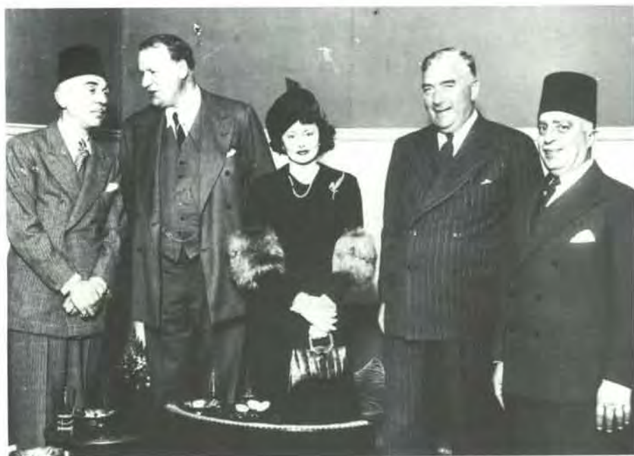
At dinner at the British Embassy, hosted by Sir Miles Lampson (second from left), Menzies chats with Hussein Sirry Pasha, the Prime Minister of Egypt and his elegant wife.