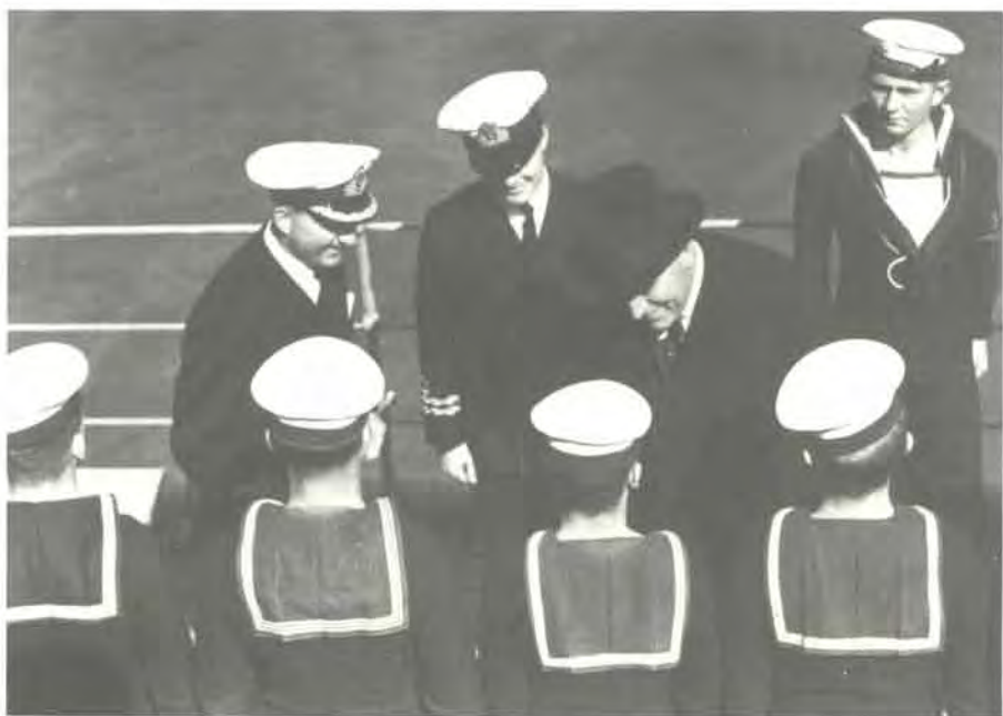
Menzies reviews the crew of an Australian warship, the Perth, serving with the British fleet at Alexandria harbour.