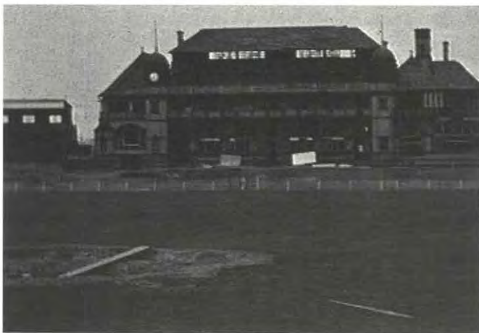
Old Trafford Cricket Ground showing bomb crater in the foreground.