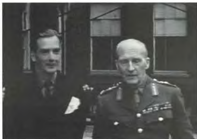
Anthony Eden, Secretary of State for Foreign Affairs, and General Sir John Dill, Chief of the Imperial General Staff.