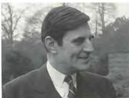
John Winant, US Ambassador in London.