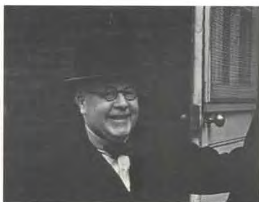
Sir Howard Kingsley Wood, Chancellor of the Exchequer.