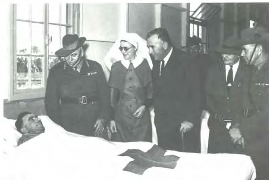
At Gaza Ridge Military Hospital nurses give Menzies a cheerful welcome (top) and (below) Menzies and Lieutenant-General Blamey visit a wounded soldier.