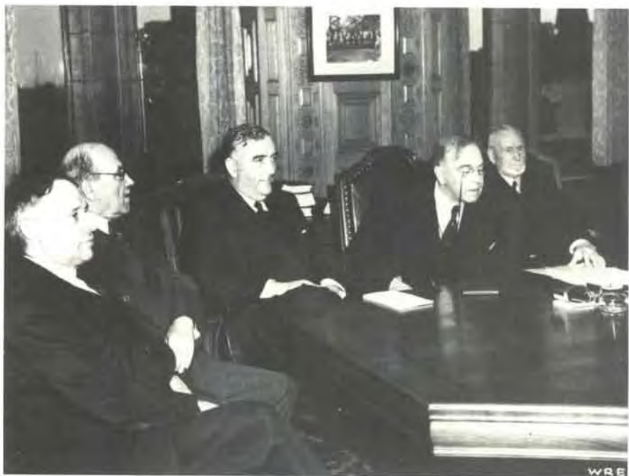
Menzies attends a special conference of the War Committee of the Canadian Cabinet.