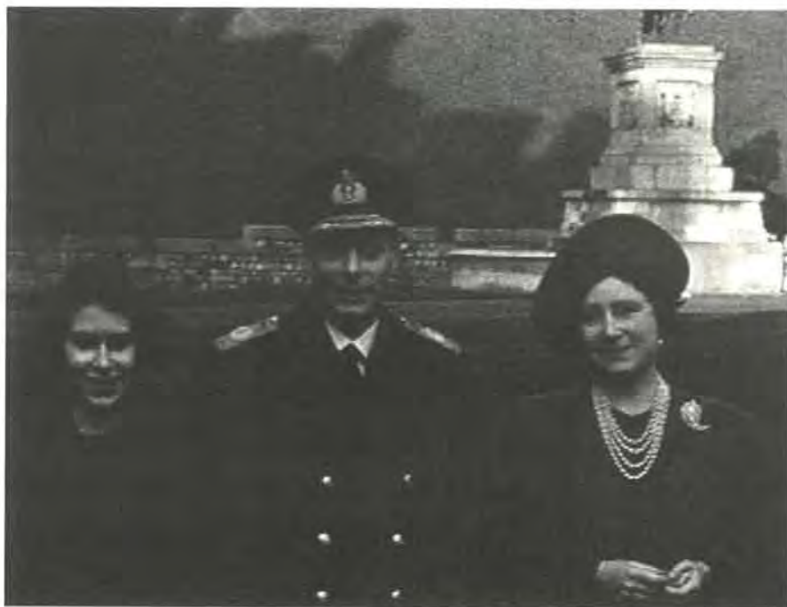
King George VI, the Queen and the young Princess Elizabeth.