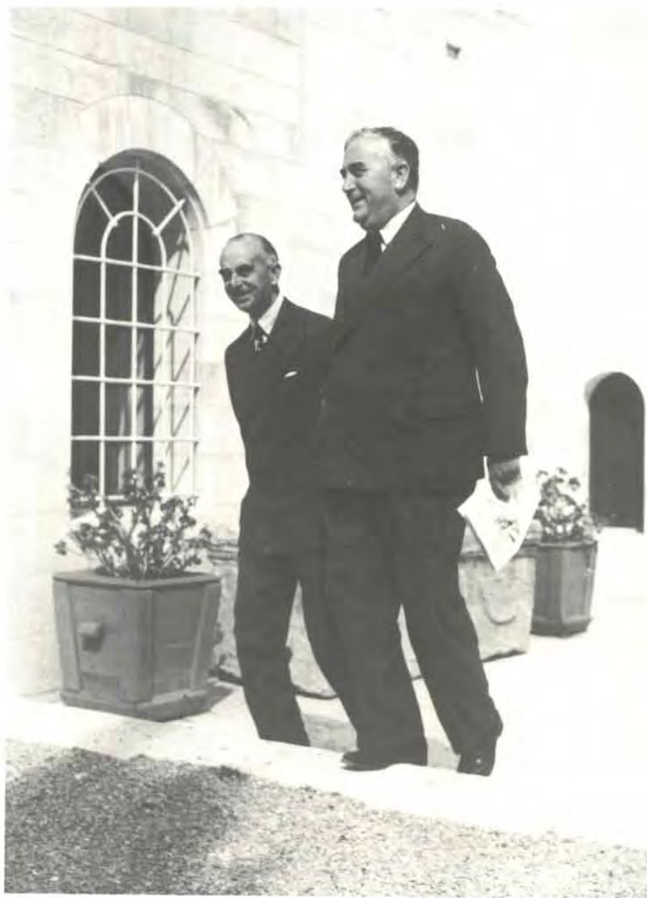
With the British High Commissioner in Palestine, Sir Harold MacMichael, in Menzies' eyes 'a most cultivated soul'.