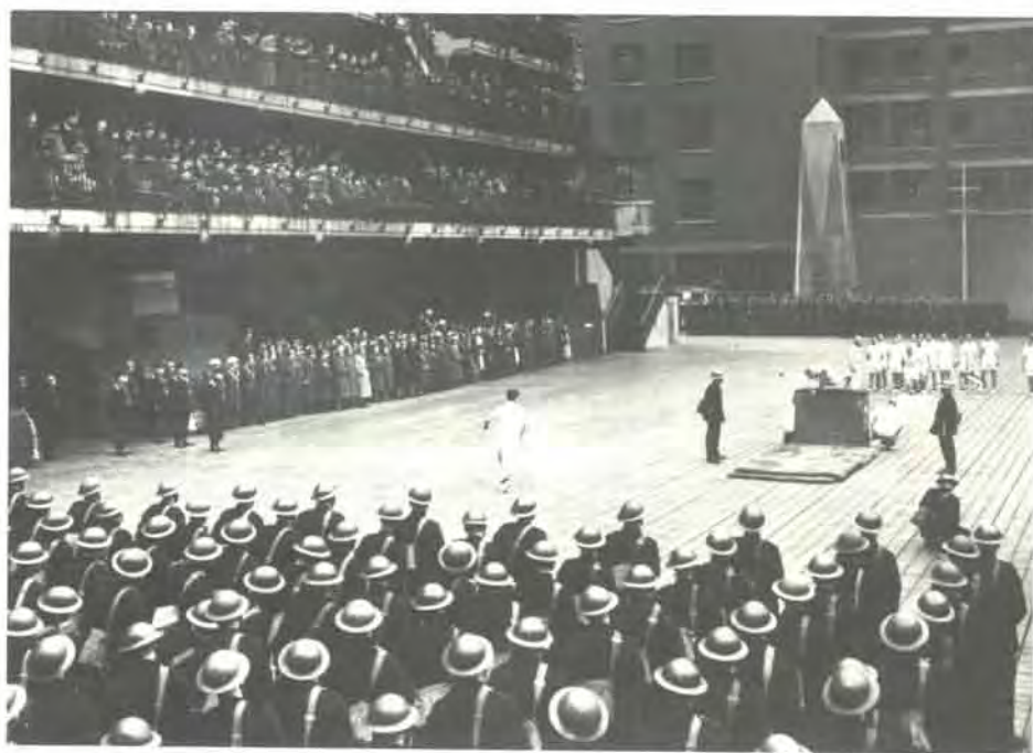
At a parade of London's Civil Defence Services the London Fire Brigade puts on a demonstration for Menzies.