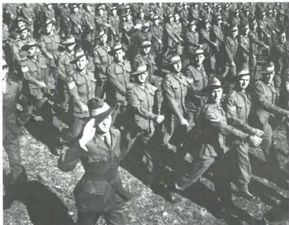
'Eyes right' as Australian troops march past at Deir Suneid, Palestine. (Menzies Papers)