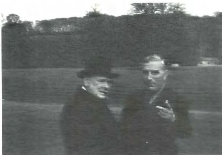
Winston Churchill with Menzies in the grounds of Chequers. (Menzies Film)