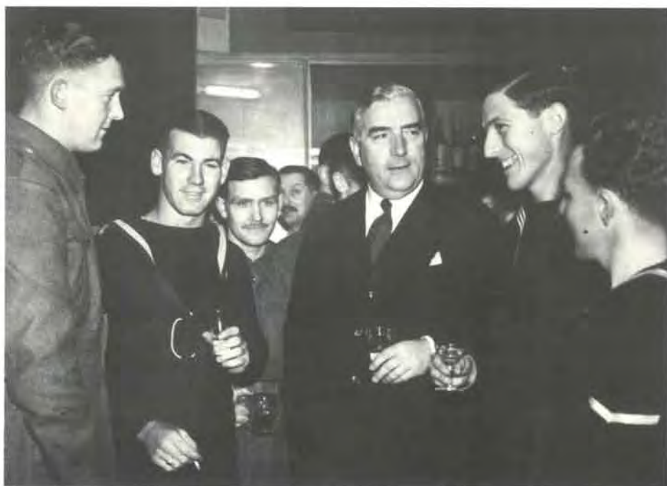
At a reception in his honour at the Overseas Club, St James, Menzies chats with Australian soldiers and sailors.