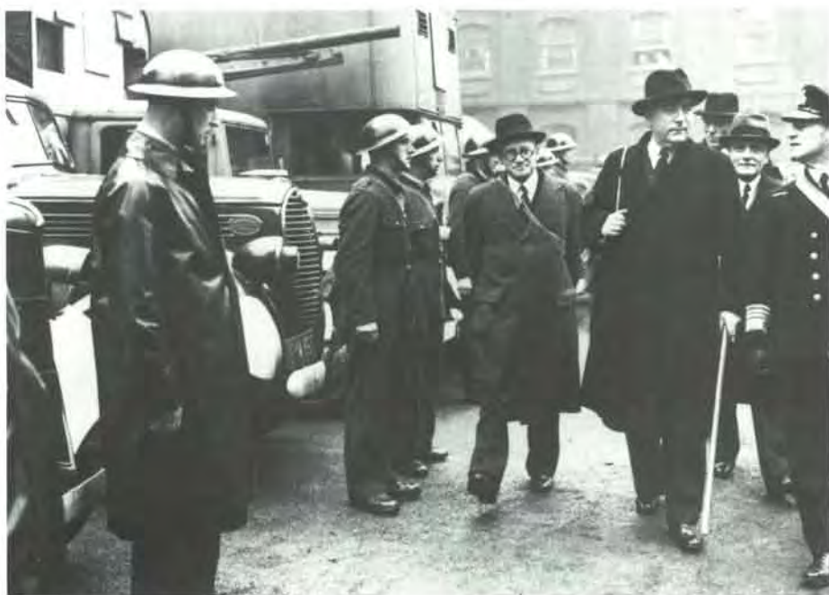
Accompanied by Herbert Morrison, Minister for Home Security, Menzies inspects Air Raid Precaution equipment at a parade of London's Civil Defence.