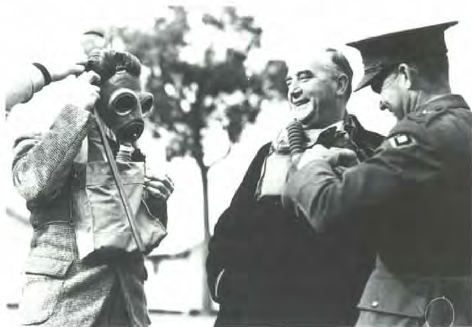
A demonstration of how to put on a gas mask. (Menzies Papers)