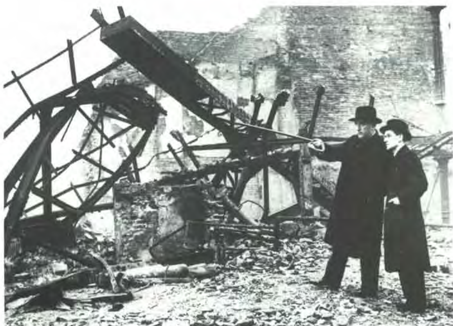
Menzies inspects the devastation caused by air raids on the City of London.