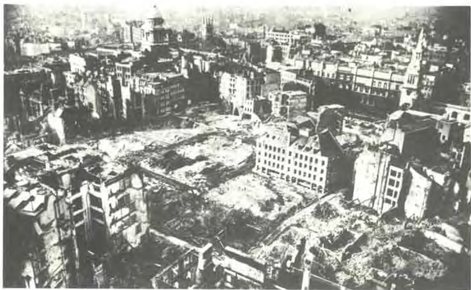
'Clearing up the ruins' after an air raid on London. This picture was taken from the top of St Paul's Cathedral looking towards the Old Bailey.