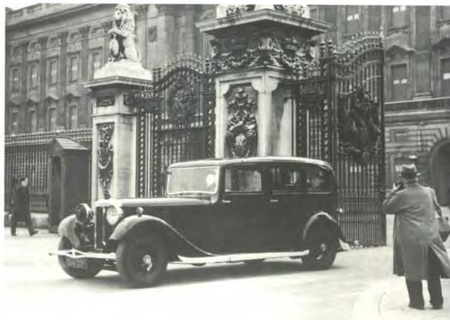
Menzies leaves Buckingham Palace after an audience with the King.