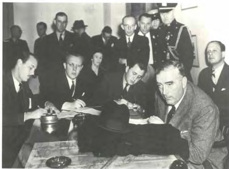
A serious Menzies briefs US journalists on his experiences of wartime Britain.