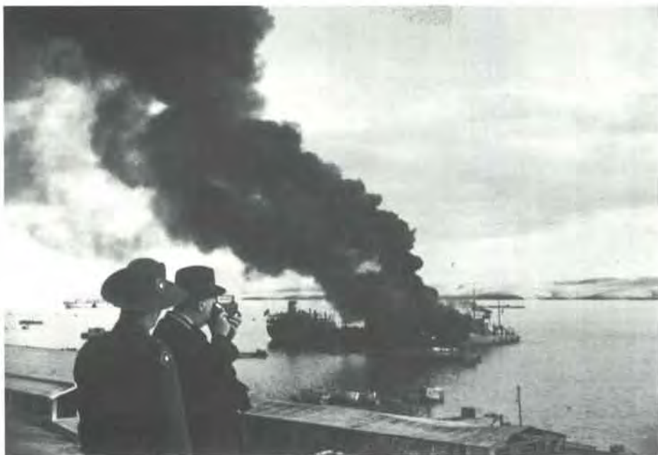
In Tobruk harbour a burning oil tanker, holed by a mine, provides a dramatic subject for Menzies' cine-camera.