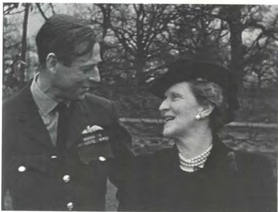
The Duke of Kent and Lady Astor.