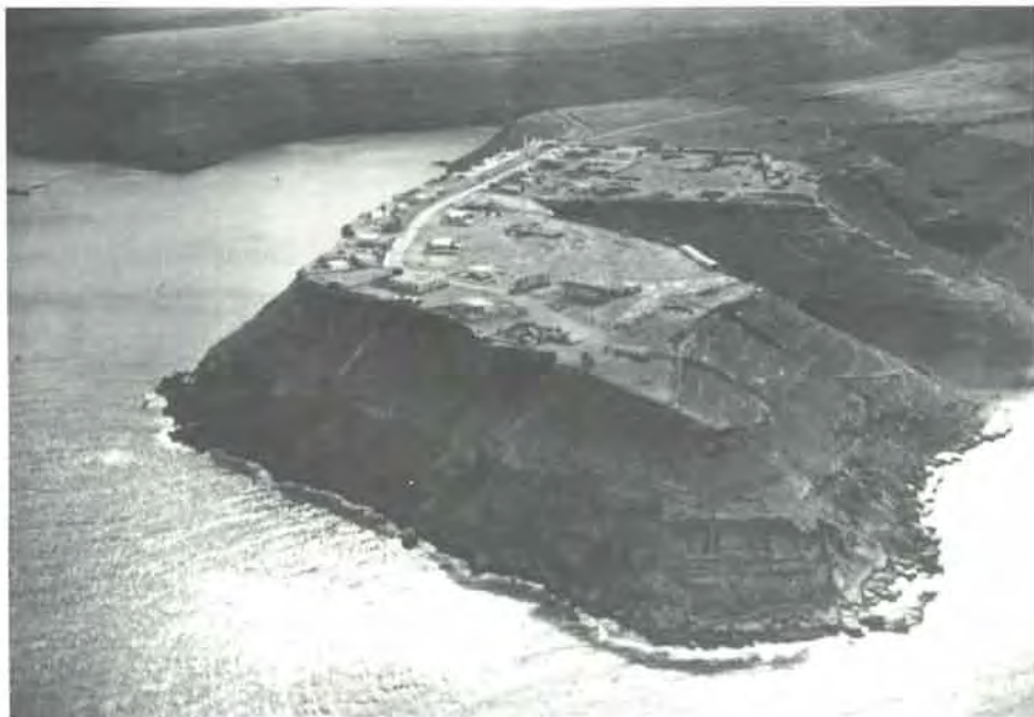
Menzies' plane circles over the small village of Bardia, scene of the Australian troops' first victory. (Menzies Papers)