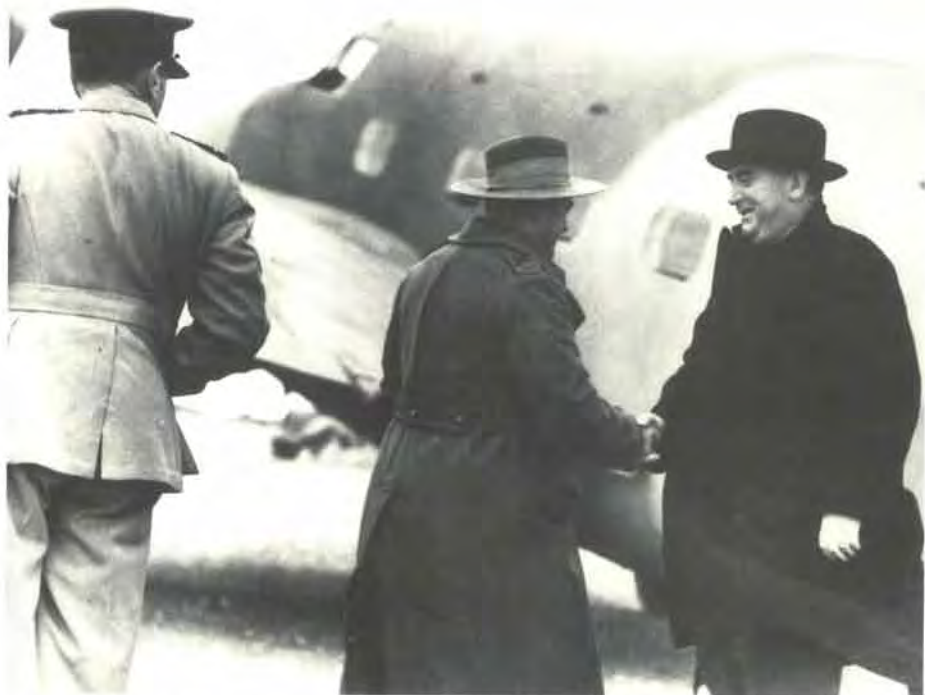
Arriving at El Adem, Menzies is met by Lieutenant-General Blamey.