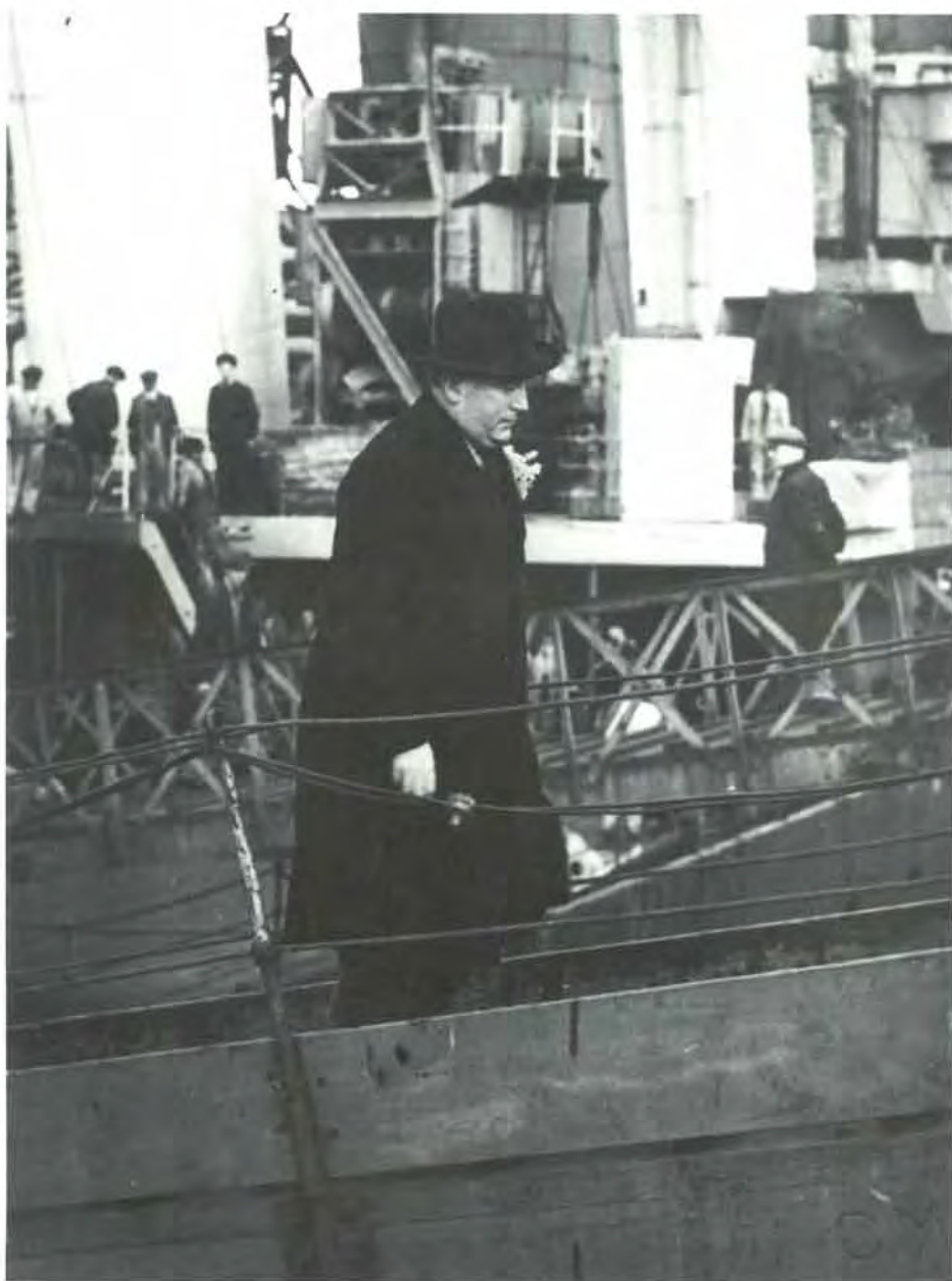
Menzies leaves a warship after a tour of inspection at Plymouth.