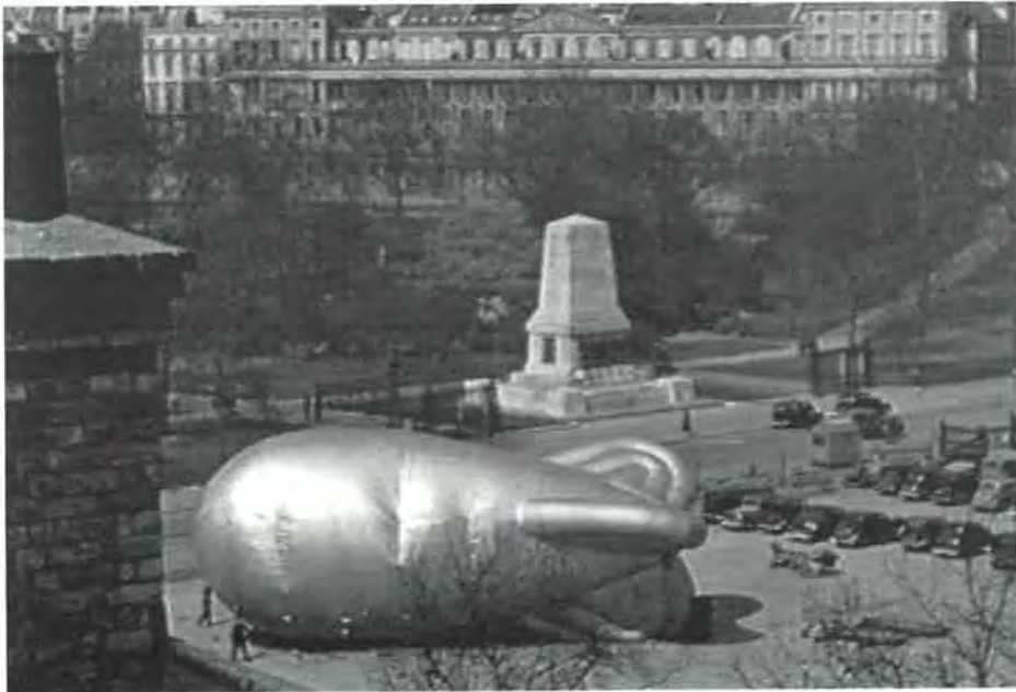
Grounded barrage balloon ('blimp') in central London.