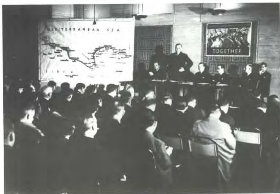
At the Ministry for Information Menzies addresses a gathering of 200 journalists on Australia's war effort. (Menzies Papers)