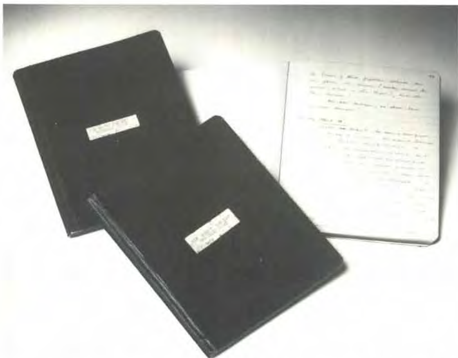
Menzies' 1941 Diary: three plain-covered exercise books, with daily entries pencilled in Menzies' firm and lucid hand. (Menzies Papers)