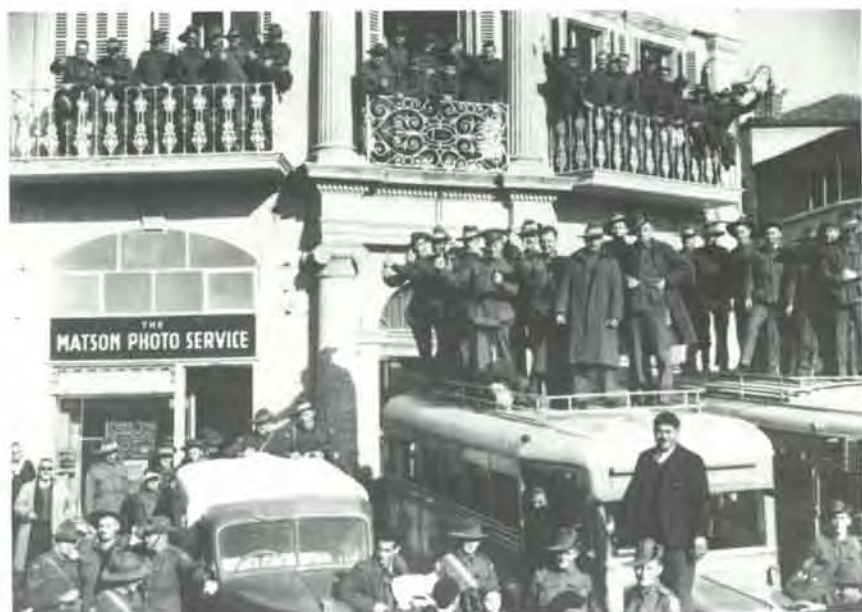
'Thumbs up' for the Prime Minister from Australian troops at the Soldiers Club, an Australian Comforts Fund hostel in Jerusalem. (Menzies Papers)