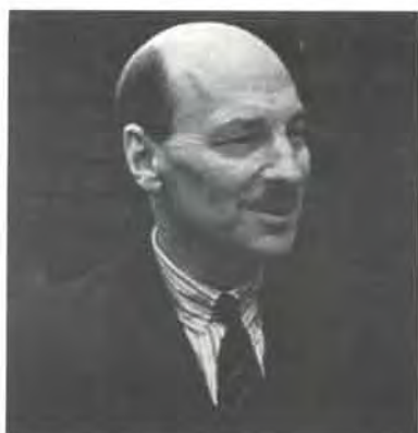
Clement Attlee, Leader of the Labour Party. (Menzies Film)