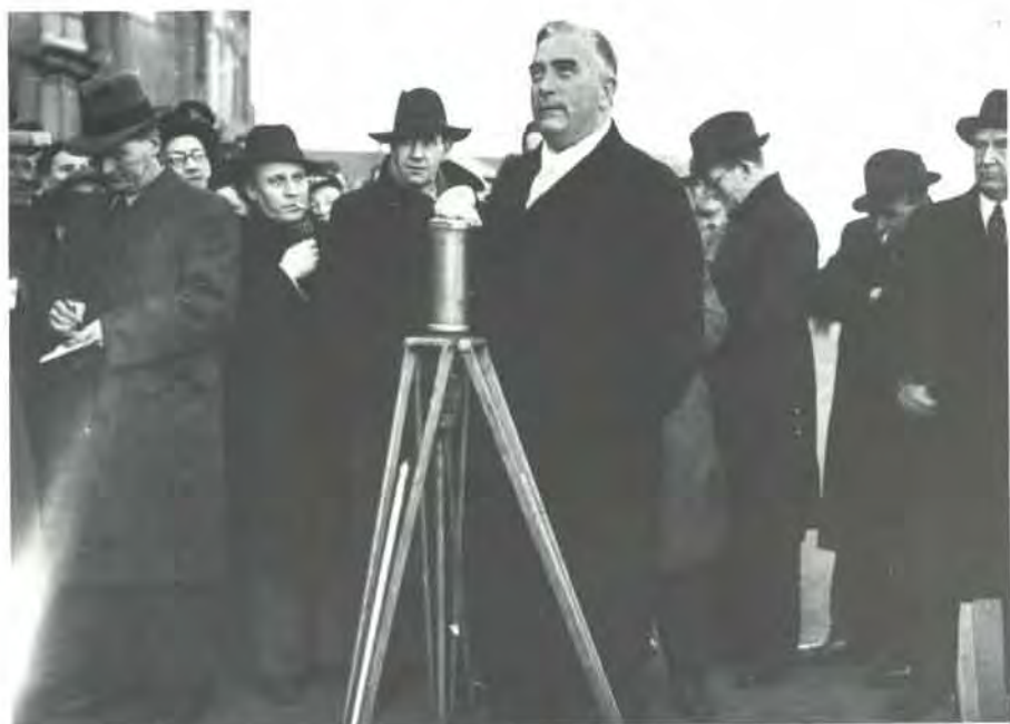
On landing in England, at Poole, Menzies speaks briefly to the British press.