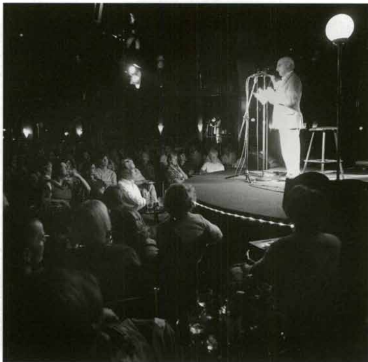
David Malouf reading poetry at Tilley's Café, Lyneham, Canberra, 1990s