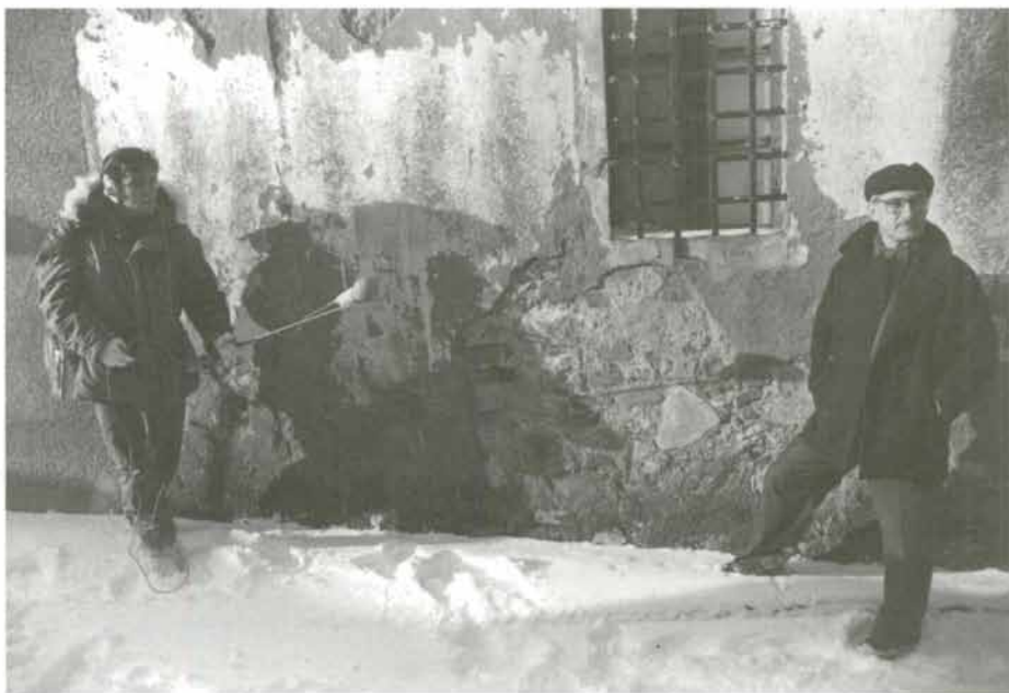
David Malouf, about to film in Campagnatico, January 1985