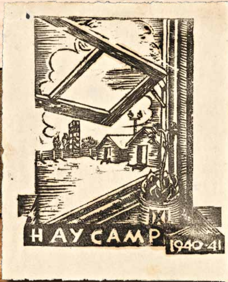
Attributed to Ludwig Hirschfeld-Mack (1893–1965) Hay Camp 1940–41 c.1941 woodcut, printed in black ink 14.0 x 11.2 cm Papers of Hans Lindau (1940–1943) Manuscripts Collection, MS 5225

To pass the time, artist Irwin Fabian taught some of his fellow internees the technique of monotype printing, using old windowpanes and printing ink made from black shoe polish. The shortage of art materials in the basic surroundings made woodcuts another popular technique.