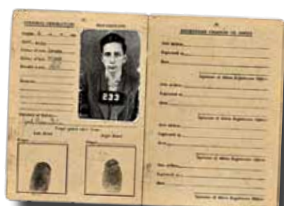
Papers of Bern Brent Manuscripts Collection, AC 09/076