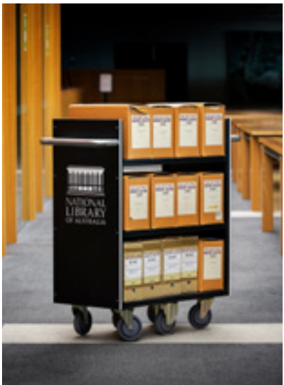
ABOVE: Special Collections Reading Room, 2021; OPPOSITE: Ellis Rowan, Golden Bowerbird (detail), 1917, nla.cat-vn1161577.