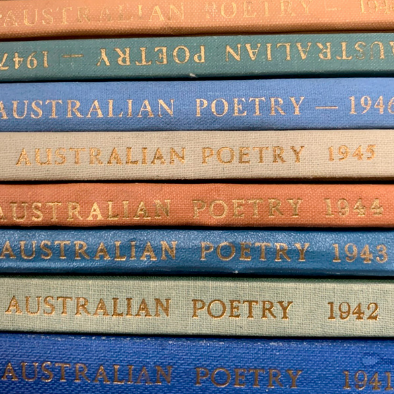
Issues of Australian Poetry , 1941–1948, nla.cat-vn2186816.

Periodicals are an important resource for understanding the development of Australian poetry and literary culture – almost 50 Australian literary journals were published in the three decades after the First World War. But this material is not widely accessible. Even the most iconic, the ‘Ern Malley’ issue of Angry Penguins , is not available online. Now, with the support of the Jibb Foundation, these landmarks of Australian literary history will be available online to educate and inspire a new generation of readers.