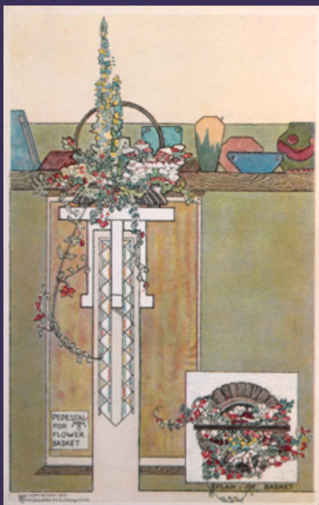
Marion Mahony Griffin, Pedestal for Flower Basket , 1912, nla.gov.au/nla.obj-150352970