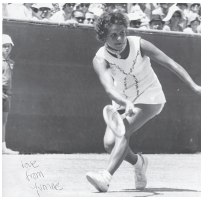
Miss Evonne Goolagong (Australia)... during the final singles against Miss Virginia Wade (Britain), 1970

The exhibition draws on a wide range of material from the Library's collections. There are photographs of famous sporting moments and personalities, posters and ephemera advertising sporting events, books, manuscript material and paintings. In addition to the Library's own collection material there are a small number of loans from the National Museum of Australia, National Sports Museum and National Rugby League. These include Ash Barty's Wimbledon dress, a Donald Bradman bat, and the first State of Origin Shield. While not all sports are represented in the exhibition, the curatorial team has done its best to select powerful and moving objects which have been chosen for their storytelling potential. ►