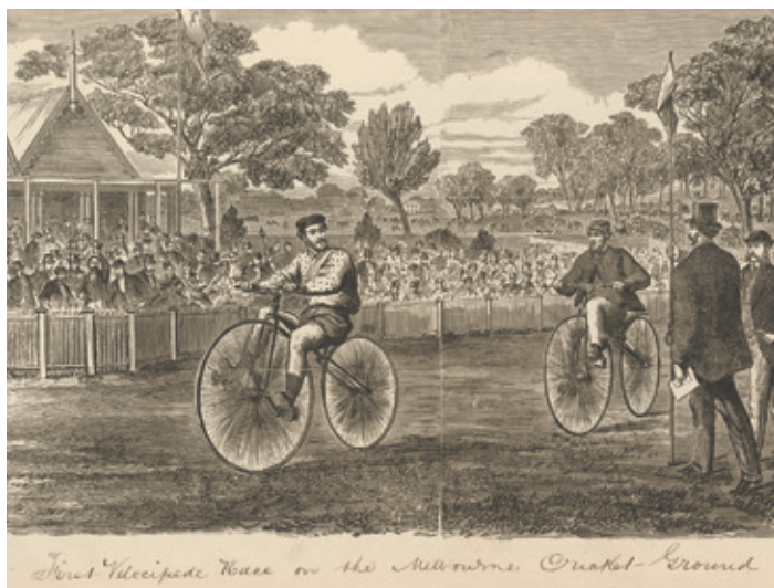
Samuel Calvert, First velocipede race on the Melbourne Cricket Ground, 1869