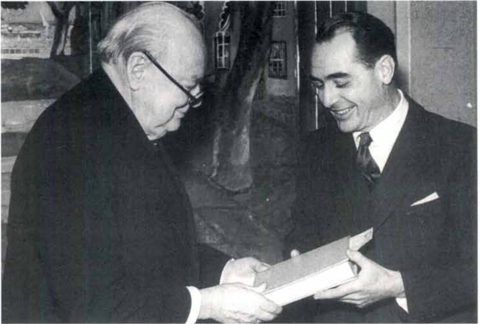
Alan Moorehead receiving the Duff Cooper Memorial Prize for Gallipoli from Winston Churchill [1956]