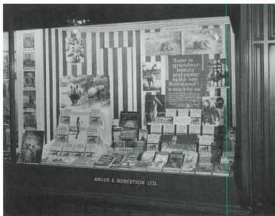
Angus & Robertson emptied its window to display Alan Moorehead's books [1956]

In Australia, where bookshops emptied their windows to display the book, the country's own war correspondent at Gallipoli and author of the Official History of Australia in the War of 1914–1918 series, C.E.W. Bean, praised the book as 'a brilliant and sympathetic reconstruction of the Dardanelles campaign'. 82 'Of course you were there in 1915', Moorehead's friend and publisher Jamie (Hamish) Hamilton chided