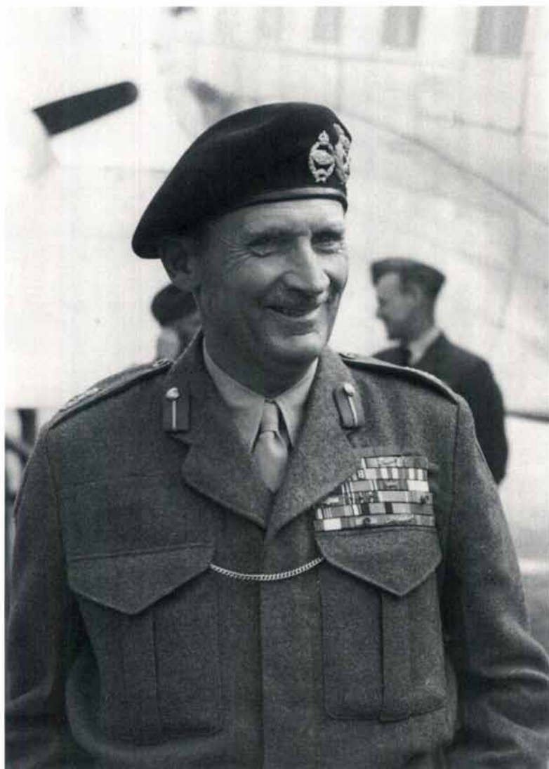
Field Marshal Montgomery [1940s] Alan Moorehead Papers MS5654, National Library of Australia nla.ms-ms5654-0-2x-o-v1 War Office photograph