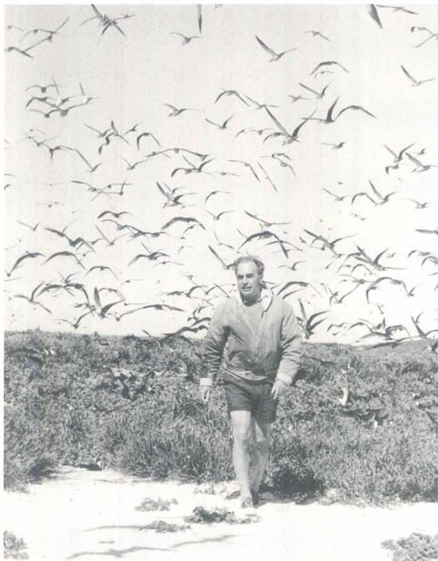
Alan Moorehead at the Great Barrier Reef [1965]