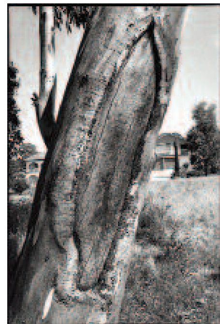
War Memorials, Wanniasa and Anzac Parade, ACT, 1998 (detail)