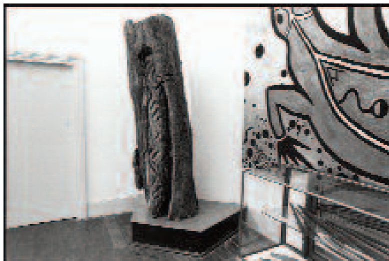
The Boorolong Carved Trees , Armidale and Boorolong, NSW, 1999 (detail)