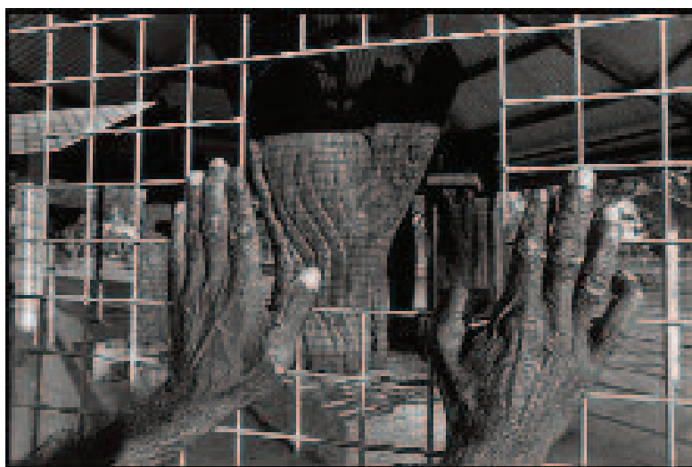
The Caged Carved Trees of Collymogle , Collarenebri, NSW, 1999 (detail)