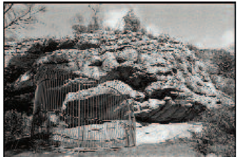
Cage of Ghosts , Mt Stayplton, Victoria, 2001 (detail)