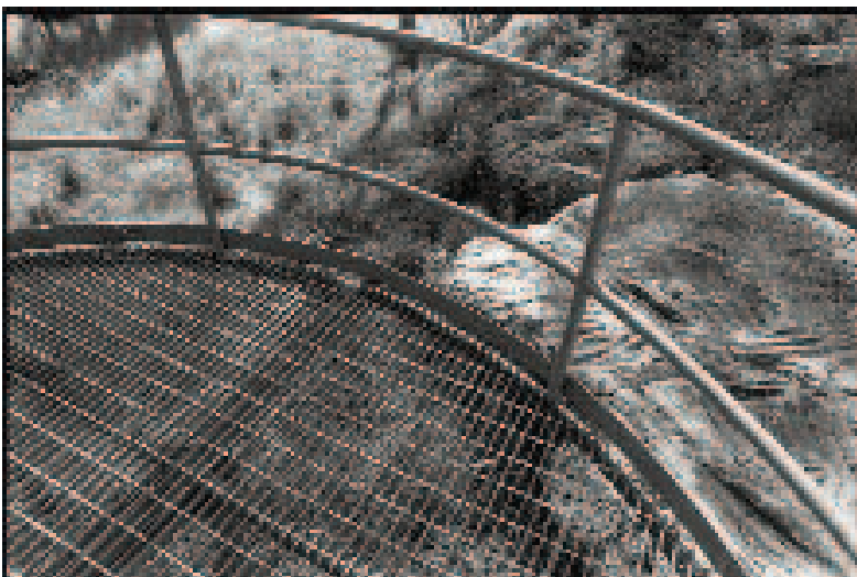
Industrial Grinding , Terramungamine and Dubbo, NSW, 2001 (detail)

I became fascinated by the amount and type of protection that surrounded most of the sites that are identified in guide books.