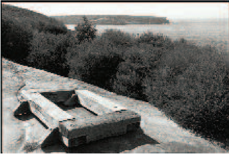
Bennelong at Grotto Point , Grotto Point, NSW, 2002 (detail)

occupation in south-eastern Australia, where the impact of European settlement has been the longest and most intense. However, rather than photograph a totemic landscape created by ancestral beings, as I had in Site Seeing , I wanted this time to find places on a human scale, created by human hands.