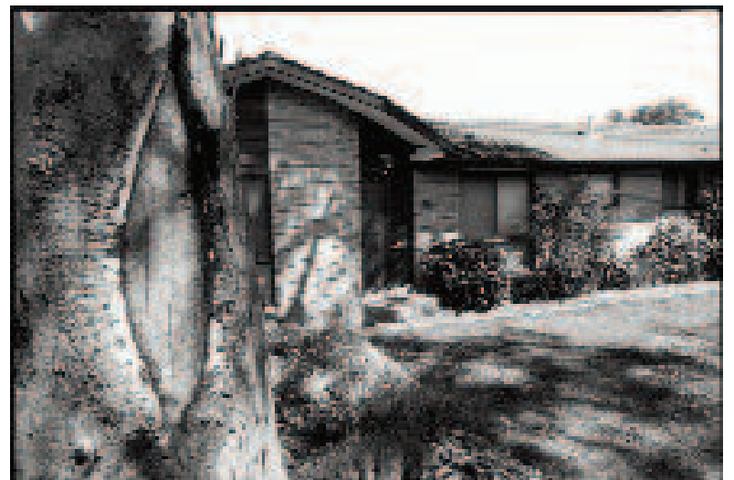
38 Sainsbury Street, Wanniasa, ACT, 1998 (detail)

The opening of Whichaway? at the Canberra School of Art Gallery in October 1998, coincided with a residency at Photomedia, in the School of Art at the Australian National University. As I unpacked my car,