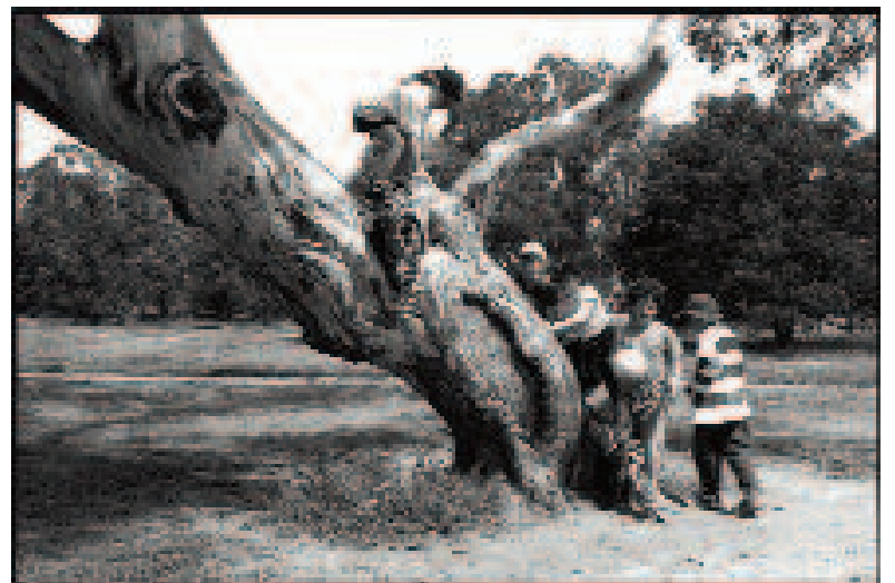
The Spook Tree, Wanniasa, ACT 1998 (detail)